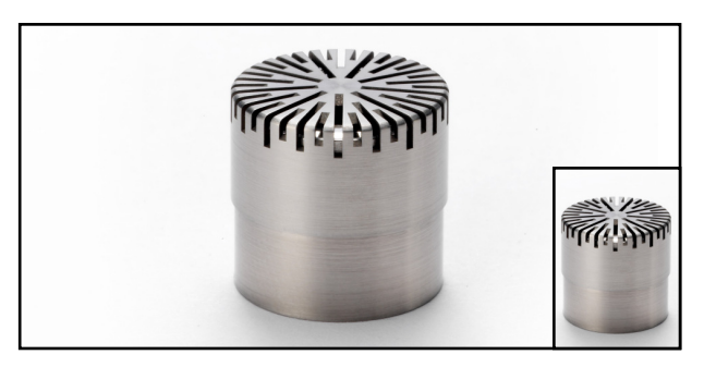
Fig. 1 ½-inch Wide-frequency, Free-field Microphone Type 40AC (inset shows true size)

Fig. 3 shows what these are in a free-field for various angles of incidence. The Type 40AC compensates for this to provide a flat frequency response at an angle of 0^{\circ} incidence in a free-field (see Fig. 2).