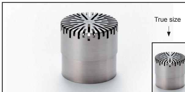
Fig. 1 1/2-inch Wide-frequency, Pressure Microphone Type 40AG

G.R.A.S. 1/2-inch preamplifiers (see data sheets for Types 26AG, 26AH, 26AJ, 26AK and 26AM) are also available for use with the Type 40AG. The mounting thread (11.7 mm - 60 UNS-2) is compatible with other available makes of similar microphone preamplifiers.