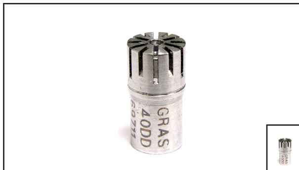
Fig. 1 1/8-inch Pressure Microphone Type 40DD (inset shows true size)

The Type 40DD must be used with an adapter (RA0063 or RA0082 - both available from G.R.A.S.) for mounting 1/8-inch microphones onto 1/4-inch preamplifiers.