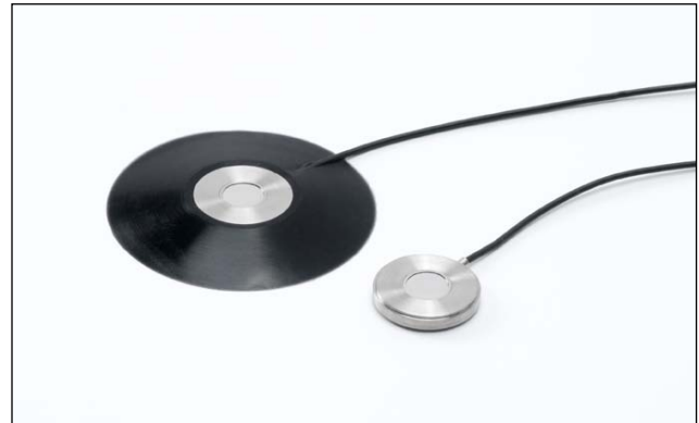
Fig. 1 40LS High-Precision Surface Microphone with and without fairing