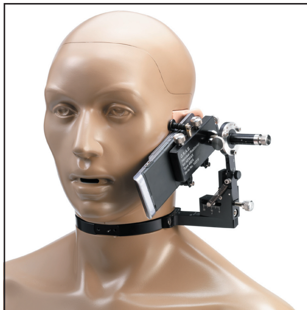
Fig. 1 Handset Positioning System Type 45EA, holding a mobile phone mounted on the KEMAR Manikin Type 45BM.

The system features nine moving segments that simulate the human arm, wrist, palm, and fingers holding a handset in the speaking-listening position.