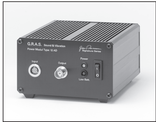
Fig. 1 Power Module Type 12AD

The input is a 7-pin LEMO socket on the front panel, which is wired up (see Fig. 2) for G.R.A.S. microphone preamplifiers, e.g. Types 26AB, 26AC,