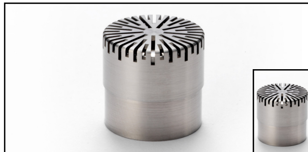
Fig. 1 1/2-inch Wide-frequency, Free-field Microphone Type 40AC (inset shows true size)

G.R.A.S. 1/2-inch preamplifiers (see data sheets for Types 26AG, 26AH, 26AJ, 26AK and 26AM) are also available for use with the Type 40AC. The mounting thread (11.7 mm - 60 UNS-2) is compatible with other available makes of similar microphone preamplifiers.