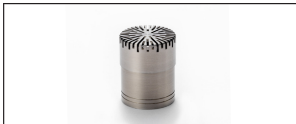
Fig. 1 1/2-inch Prepolarized, Random-incidence Microphone Type 40AQ

Fig. 2 shows a frequency response typical of a Type 40AQ when placed in a diffuse sound field.