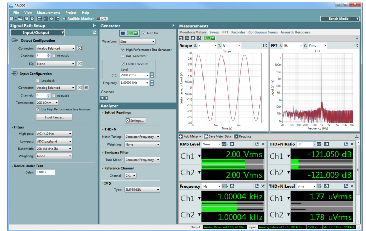
APx500 Bench Mode, showing live meters and monitors for waveforms, FFT, RMS levels, frequency and THD+N.

Bench Mode provides a real-time interface, with waveforms, FFTs and meters for virtually any parameter enabling the identification of important device interactions.