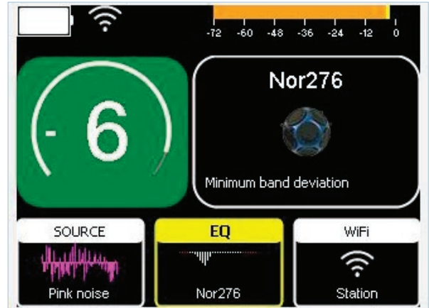
Predefined spectrum shape for Norsonic speakers

The output signal including the equalized spectrum shaping is displayed in real time on the color display including a separate bargraph on the top of the spectrum indicating the overall noise level.